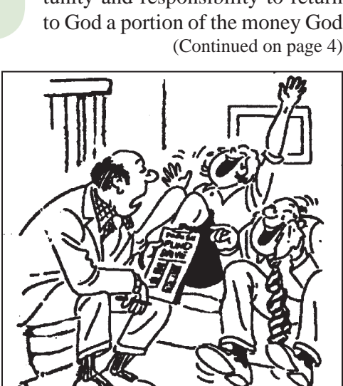
"That was just a suggestion, based upon your income! How much did you want to pledge?"

Today we still have the opportunity and responsibility to return to God a portion of the money God (Continued on page 4)