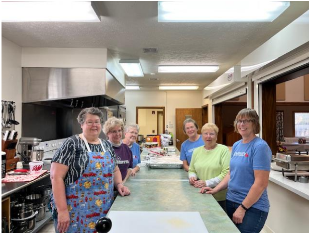
Social Ministry Committee Corner